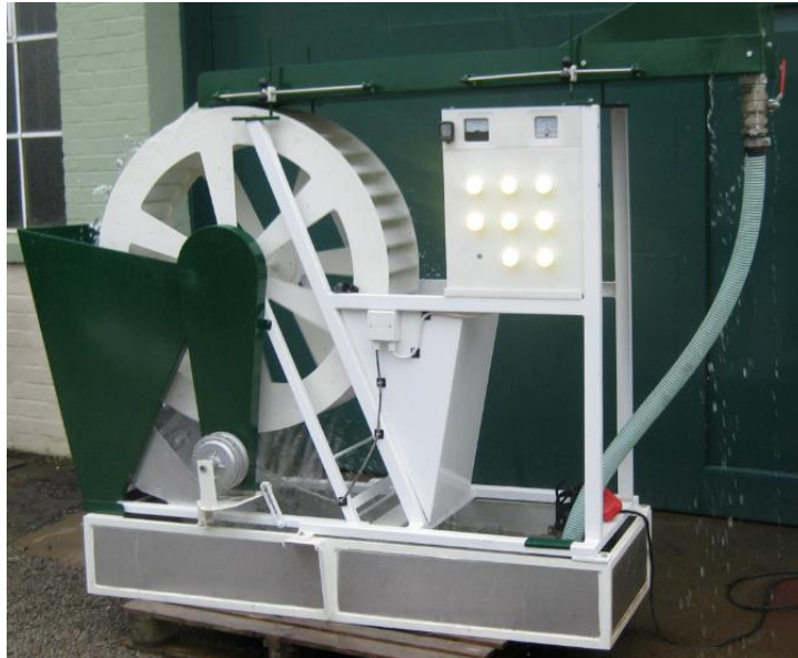
Figure 1: Prototype 1m diameter overshot waterwheel with water return by a submersible pump and connection to an LED lighting display.

The initial wheel and buckets are made from sheet metal and a submersible pump returns the water to a launder which feeds the water back onto the wheel. Electricity is generated via an induction motor to light up a low voltage LED lighting display. Initial tests on the prototype modern waterwheel have shown it is effective and can provide a platform for further redesign.