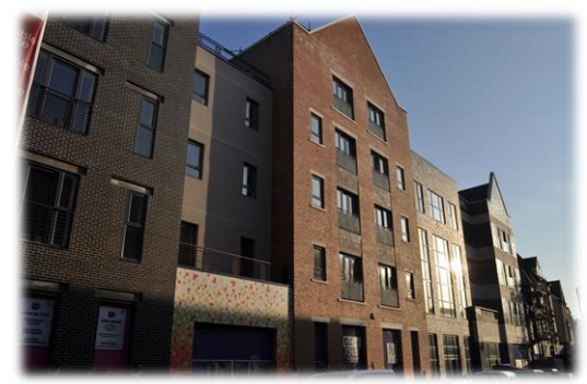
Figure. 4. Urban Village on the Swansea High Street in 2015 [22].

street-food theme. The Urban Village apartments number 80 and are rented under the concept of "City Living" and seek to bring life, energy, and economic prosperity back to the High Street area. This is the fundamental basis for supporting the sustainable regeneration agenda and also meets several of the Welsh Government's wellbeing goals as part of the Wellbeing of Future Generations Act (Wales) 2015, of 'a resilient Wales', and 'a Wales of cohesive communities' [1]. Essentially, the Urban Village has been successful in bringing people back to living and working in the city of Swansea.