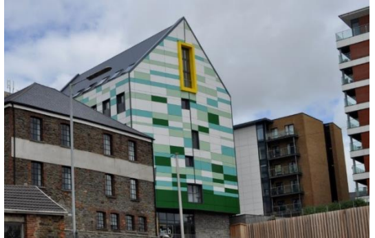
Figure. 5. Rear of Urban Village - Swansea in 2017 [23].

entrepreneurial software design specialists. The "Warehouse" on the left of Figure 5 is also available for similar industries. It is anticipated that this area will become established as a creative hub for these industries adding to a new cultural feel for the High Street. In the right hand corner some of the 80 apartments, with southward facing balconies can be seen.