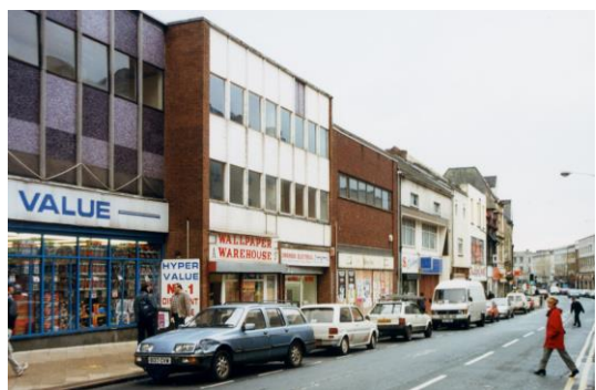
Figure 1: Swansea High Street early 1980s, uninspiring architecture

One of the most important areas of a city are those that are around the major transport hubs such as train and bus stations. In Swansea, one of the main highways into the city from the train station is known as High Street, which is situated in the Lower Super Output Area (LSOA) of Castle Two [5]. Castle Two is ranked as 11 out of 1896 for the most deprived areas in Wales, according to the Welsh Index of Multiple Deprivation, 2014 [6]. Unfortunately, since the late 1970's there has been a cumulative decline on the High Street. This critical gateway to the city as visitors emerge from the mainline train station saw the main retail area shift to the west of Swansea city along with key retail outlets. The area's decline was heightened by the rise of out of city retail centres and enterprise zones. The High Street thus became from the 1970's an area with a fairly uninspiring streetscape and essentially a place that people no longer wanted to visit, which continued into the 1980s, see Figure 1 below. All these ingredients conspired unwittingly to create an unwelcoming environment; once prosperous bars (known as pubs in the UK) closed, older buildings became dilapidated, and anti-social behaviour became prevalent. This degeneration was particularly poignant given visitors to Swansea were left underwhelmed by their initial introduction to the city as they hurried along this main artery of the city to simply be somewhere other than on High street.