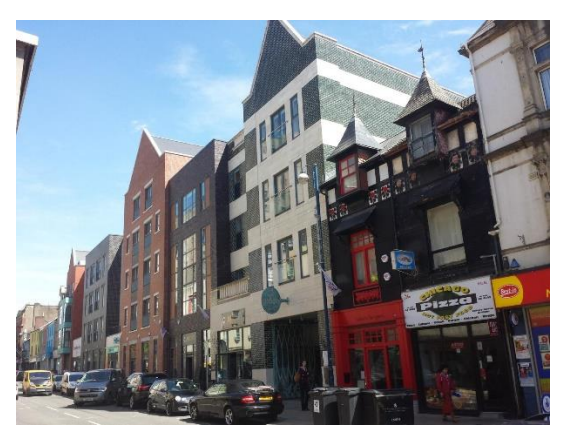
Figure. 5. Urban Village on the Swansea High Street in 2017 [23].

Figure 5 below shows the Urban Village in 2017 demonstrating a clear shift from the derelict and empty buildings of the 1970s/80s, compared with Figure 1 above.